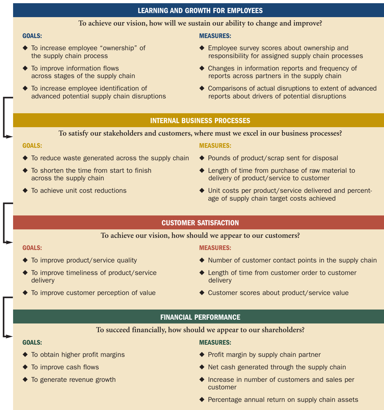
Figure 2: Example of a Balanced Scorecard Framework for Supply Chain Management