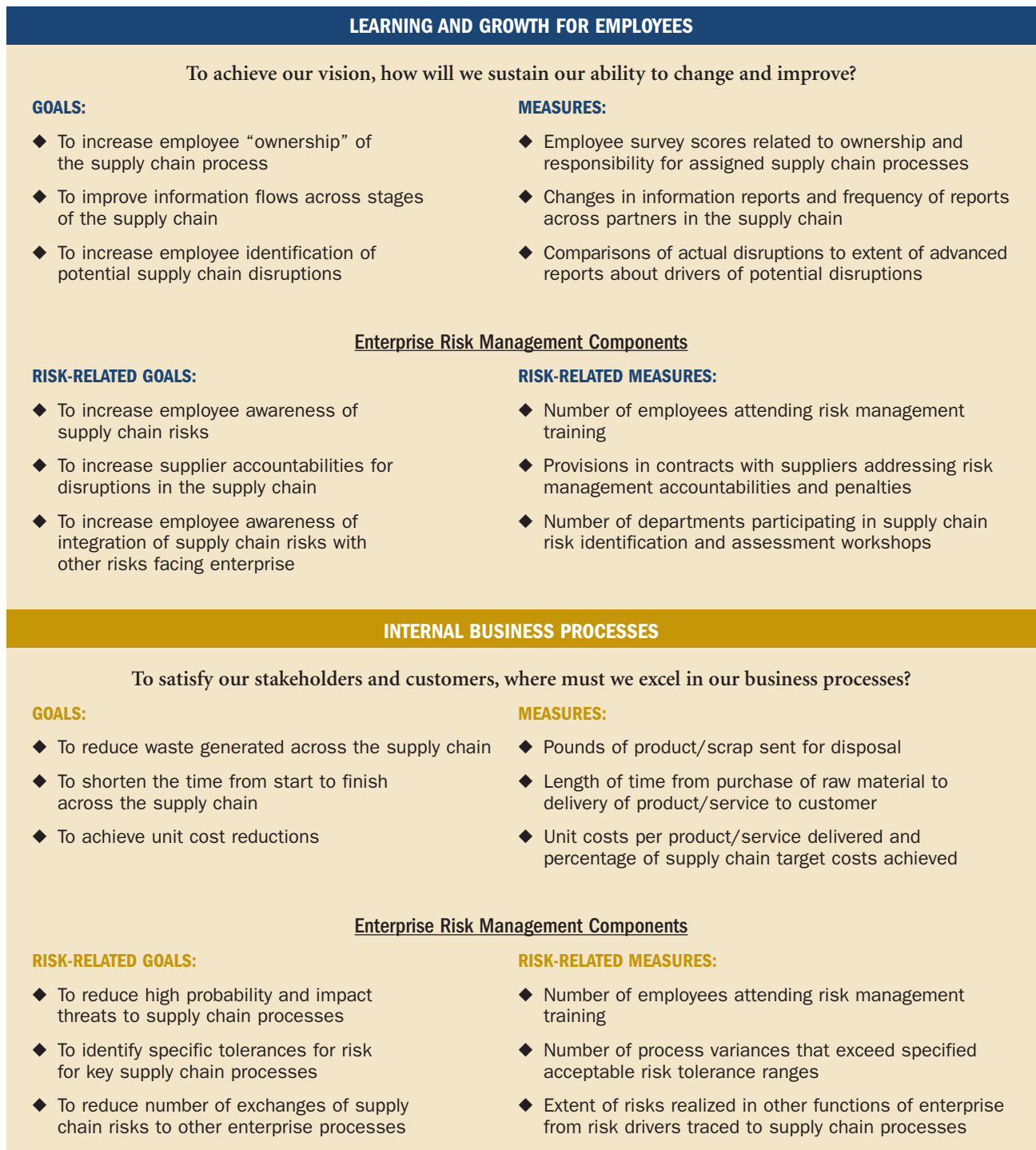
Figure 3: Example of an Integrated Balanced Scorecard and ERM Framework for Supply Chain Management

to meet growing stakeholder expectations for effective risk management. An already existing performance measurement infrastructure—the balanced scorecard—can be leveraged to provide an enterprise-wide view of risk objectives and performance. The balanced scorecard’s focus on measuring progress toward achieving strategic objectives and ERM’s emphasis on addressing positive