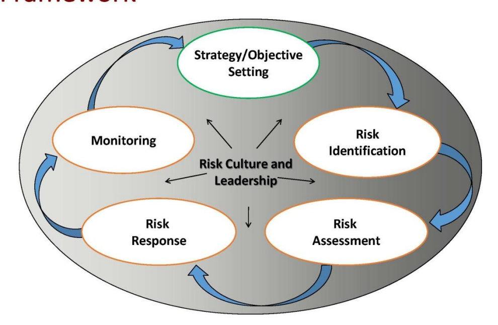
Figure 3 ERM Framework

The diagram in Figure 3 illustrates the core elements of an ERM process. Before looking at the details, it is important to focus on the oval shape to the figure and the arrows that connect the individual components that comprise ERM. The circular, clockwise flow of the diagram reinforces the ongoing nature of ERM. Once management begins ERM, they are on a constant journey to regularly identify, assess, respond to, and monitor risks related to the organization's core business model.